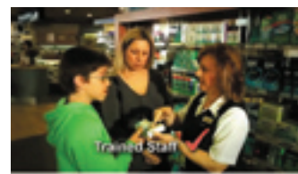
Above: Screen shots from the new QCPP television commercial