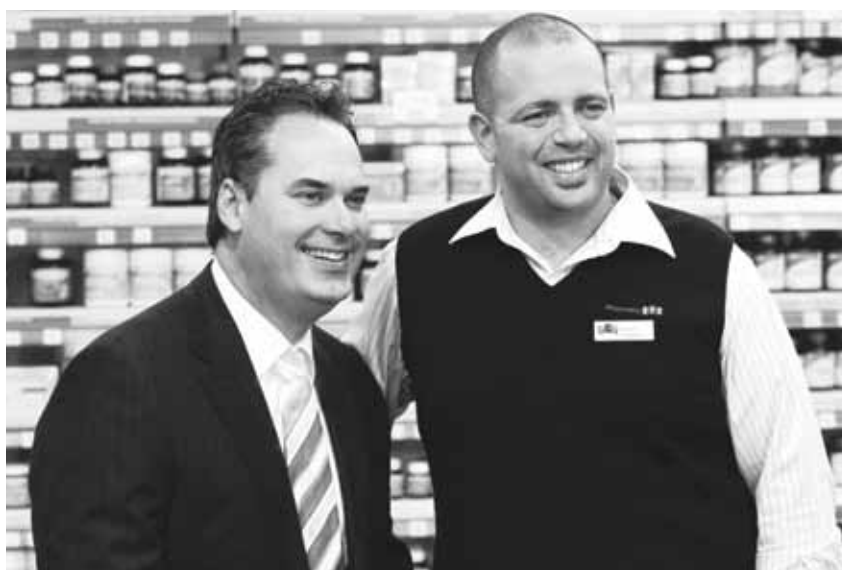
Excellence in Innovation in Community Pharmacy