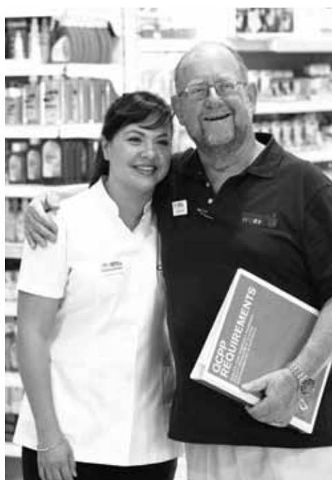
Excellence in Business Management ChemistWorks Whitherill Park, NSW

The Pharmacy of the Year competition is an excellent and informative initiative that provides the greater pharmacy industry with the knowledge of how your peers are performing and how they continue to innovate. Applications for 2012 Pharmacy of the Year competition open later in the year and we encourage all pharmacies to take the opportunity to showcase how your pharmacy services the local community and what it is that your pharmacy does best. ■